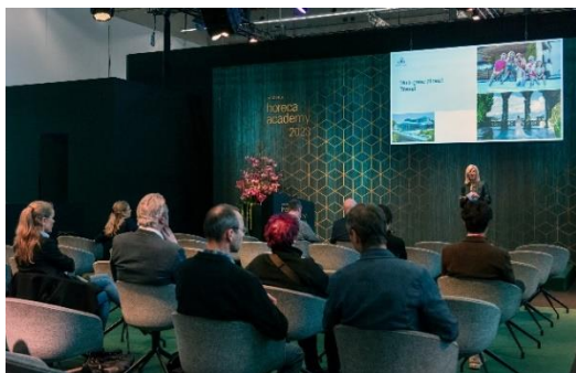
The HoReCa Academy offers the hospitality industry a tailor-made fringe programme with top speakers at Ambiente 2024.